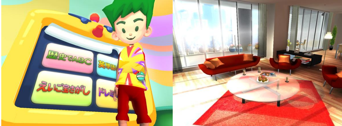
Educational services offered to children

We anticipate the range of applications offered to users to be extremely flexible and wide.